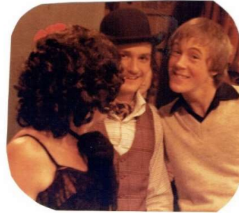
Cast & crew Music Hall 1983