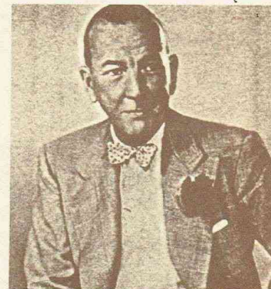
Noel Coward in the 1930's.