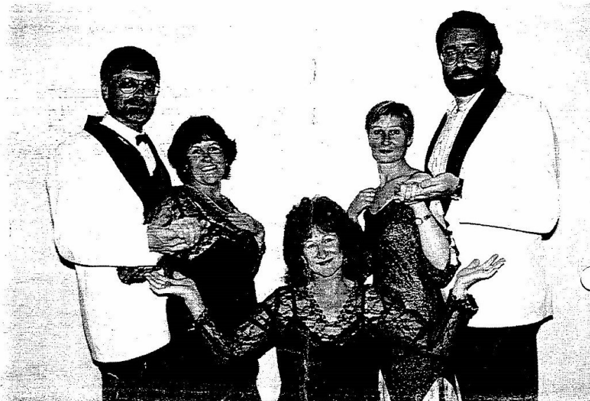
The Mad Mad World Of Theatre