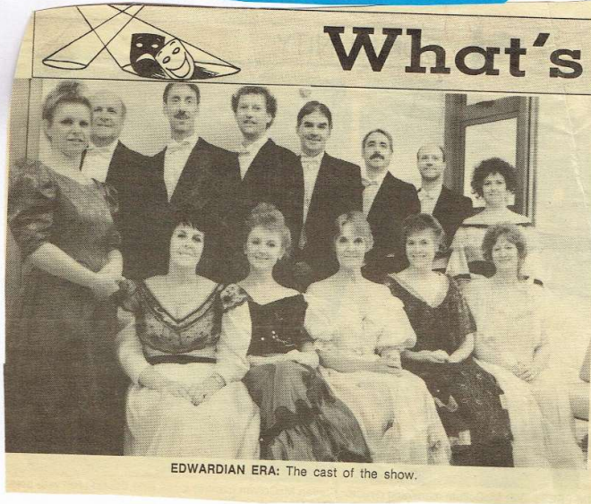
EDWARDIAN ERA: The cast of the show.

"Pardon Me is My Music Disturbing" 1994 94