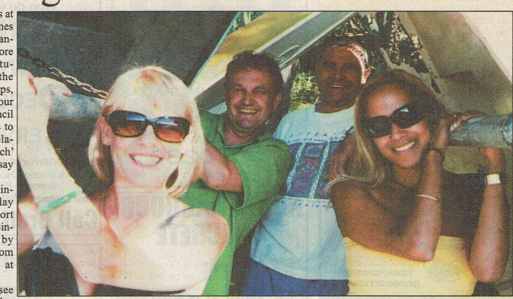
Happy holidays...but there's a serious undertow

picture postcard, but relations sour as the