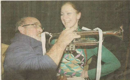
Music for sofa: Granddad is obviously a problematical character.