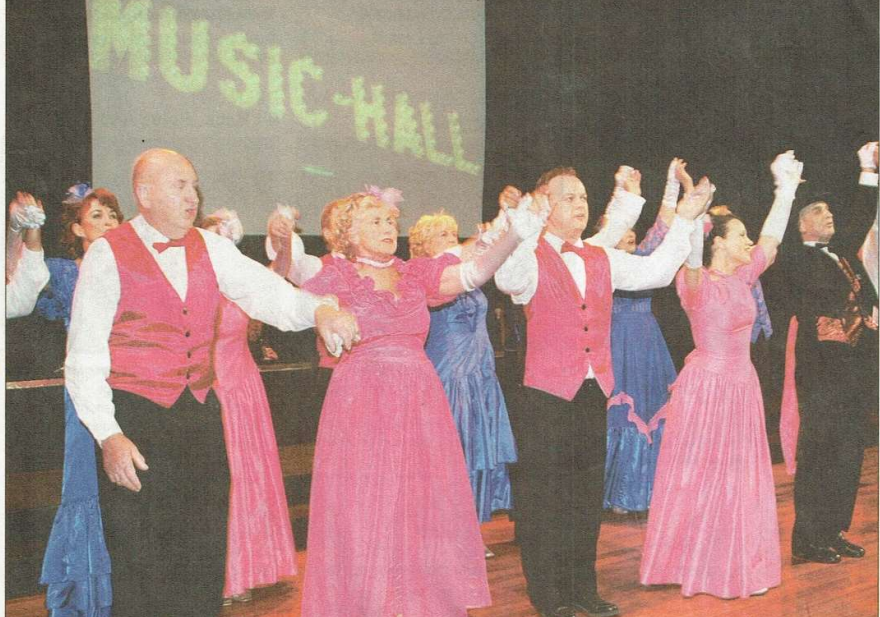
Dancing the night away...the MUSIC HALL cast