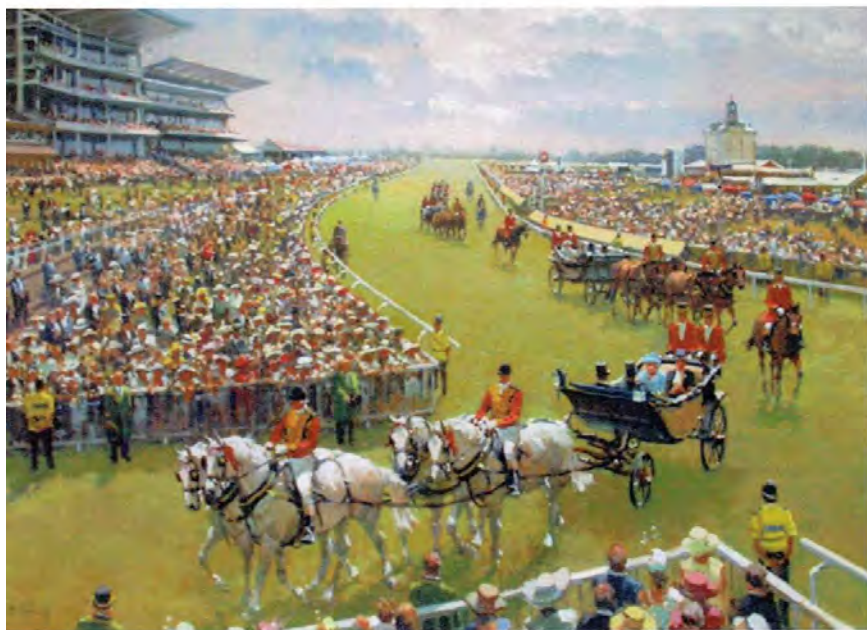
The Queen arrives to a tumultuous welcome at Royal Ascot, York, June 2005