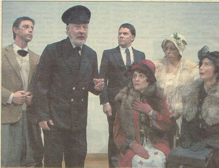
Ghostly business: Come and see this chilling comedy at the Rose Centre.

"Bah humbug" is the reply of the worldly