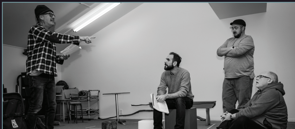
Rehearsals get underway for Neville's Island